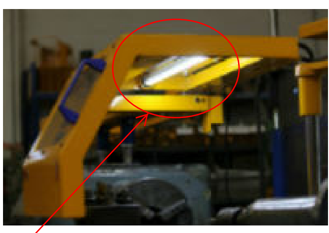
Led Lighting System for Minor